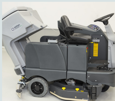
Tip-out and lift-off recovery tank