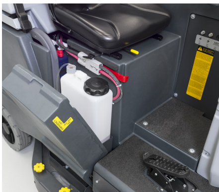
Ecoflex chemical kit (optional): easy to access detergent cartridges