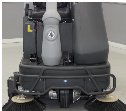
Dual side brooms (cylindrical models) deliver true edge cleaning