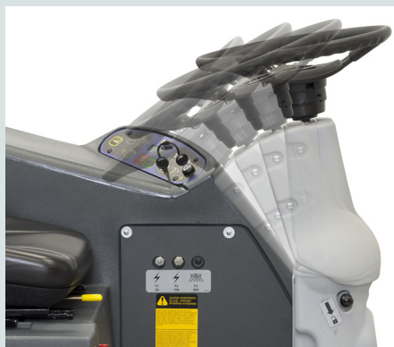
Ergonomically designed operator compartment with tilting steering wheel for easy access, operator comfort and safety